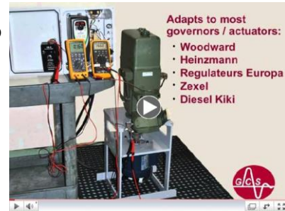
GCS Mobile Governor Test Stand