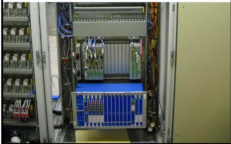
Interior of New Control Cabinet