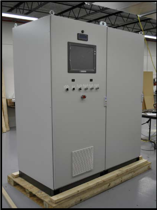
Exterior of New Control Cabinet