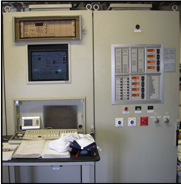
Original System On-Site