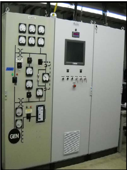
New System Installed On-Site

As a part of the MSHS group of companies, GCS offers comprehensive control system support, from engine and turbine systems integration to turnkey project management for a broad range of marine, power generation and industrial projects. GCS engineers have experience with control system retrofits in all of these industries and aftermarket applications. Learn more at GOVCONSYS.COM .