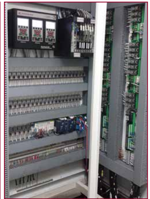
Interior of New Control Cabinet

GCS offers comprehensive control system support, from engine and turbine systems integration to turnkey project management for a broad range of marine, power generation and industrial projects. GCS is a member of the MSHS Group. Learn more at www.govconsys.com or email us at sales@govconsys.com