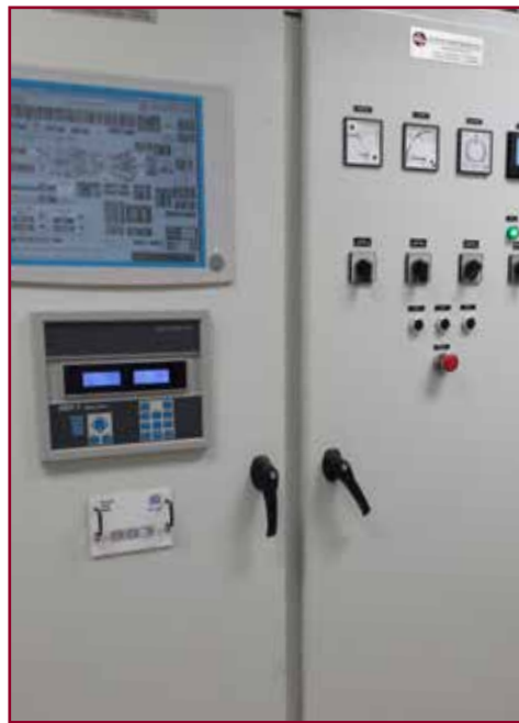
New System Installed