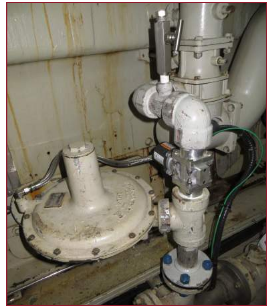
▶ L-Series fuel valves installed.