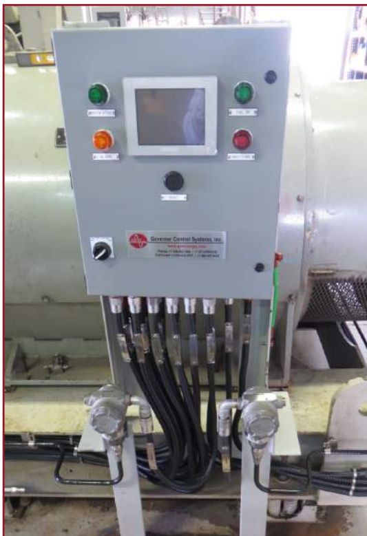
▶ Cabinet installed