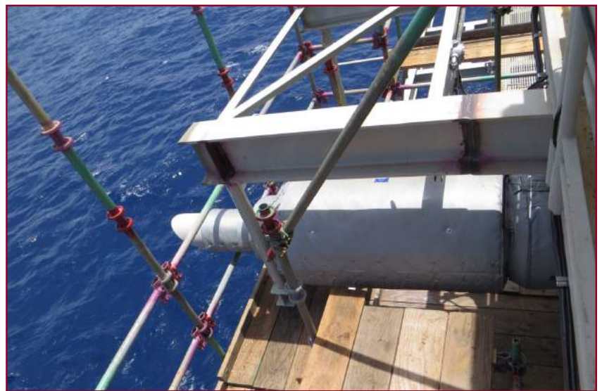
▶ Catalyst and silencer installed.

GCS offers comprehensive control system support, from engine and turbine systems integration to turnkey project management for a broad range of marine, power generation and industrial projects. GCS is a member of the MSHS Group. Learn more at www.govconsys.com or email us at sales@govconsys.com