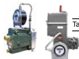
Tach Kits – Self-powered, Reliable Speed Monitoring