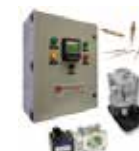
E3 Air/Fuel Ratio Control System – Integrated Speed Control & Governing featuring StableSense™ Technology