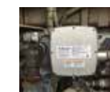
R-Series Actuator Replacement Kit for Waukesha ESM Engines