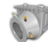
Exhaust Emissions, SRT & SCR Systems