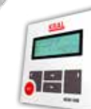
Fuel Measurement Systems